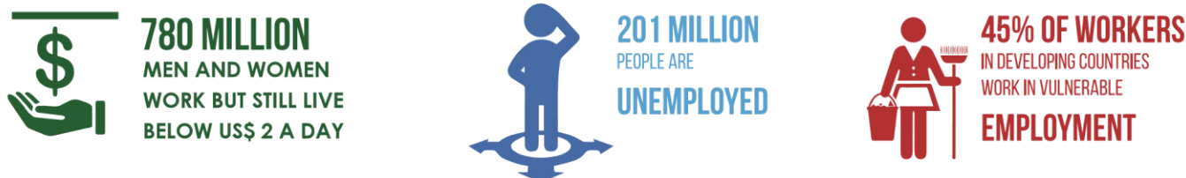
source: Decent work and transforming global growth for sustainable development. Guy Ryder, ILO (2015)

Inclusive growth requires attention not just on economic issues such as output and productivity, but also on social issues such as inequality, exclusion, and environmental issues such as resource management and control of pollution. It should also be aligned to issues related to how growth takes place (Box 1).