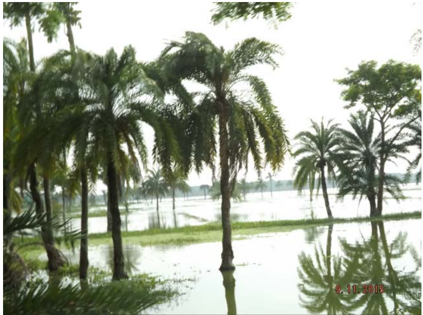
Water logged paddy field.