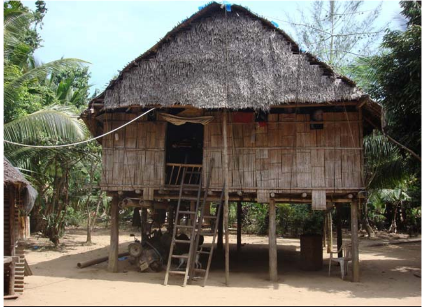
Rehabilitation Peoples Perspectives, Nicobare Hut.

Understanding discourse on risk and uncertainty was never a central theme in Anthropology. However, the main focus of anthropology of studying indigenous population living close to nature, laced with so many uncertainties, has been well documented. The worldview of indigenous people, to preserve, conserve and propagate their cultural and natural resources,