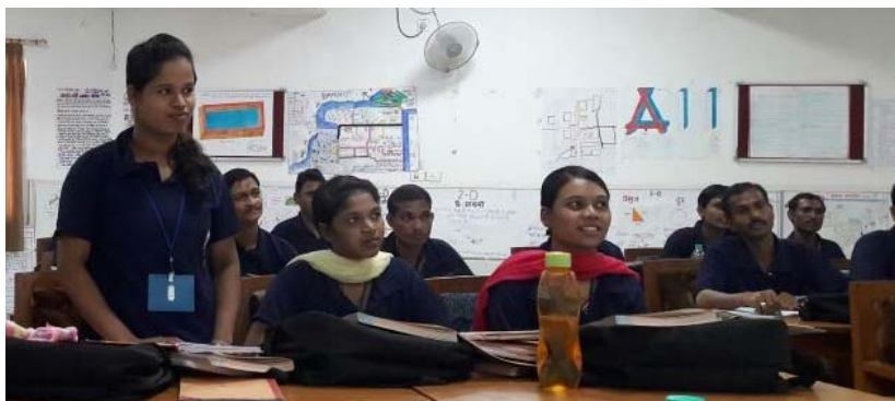
A young girl undergoes training to become a barefoot technician for MGNREGA rural works at the State Institute of Rural Development (SIRD) in Raipur, Chhattisgarh.