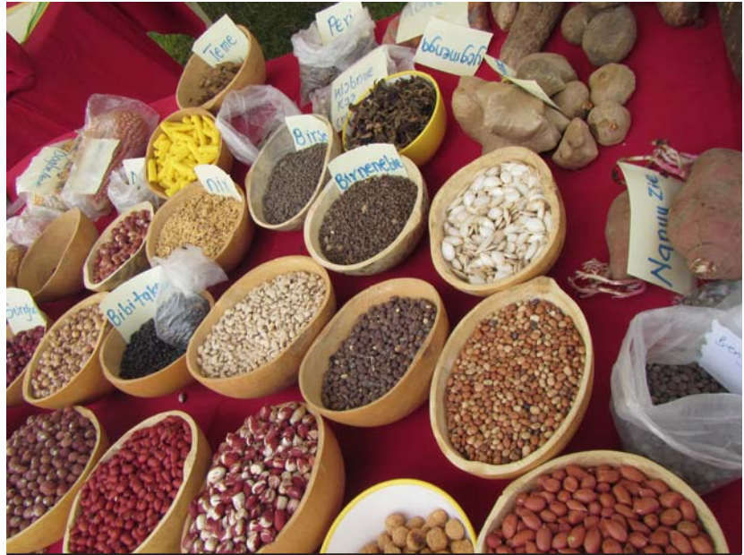
Indigenous food exhibition.

Building community resilience is a powerful approach that values the strengths and assets of marginalized people to respond to the stresses and shocks they experience. In working with the Dagara people of Ghana, for example, I learned of five interdependent actions they thought were essential to build the resilience of their communities. The five actions are: revitalizing culture and spirituality, healing the ecological