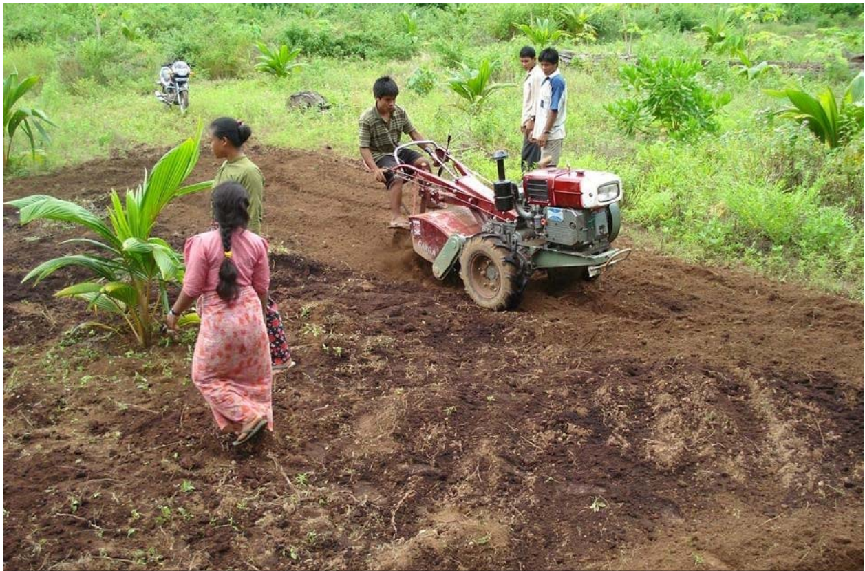
New Initiatives in Agriculture.

tribes still untouched by outside world, living in Sentinelese islands on their own surviving for ages 1 .