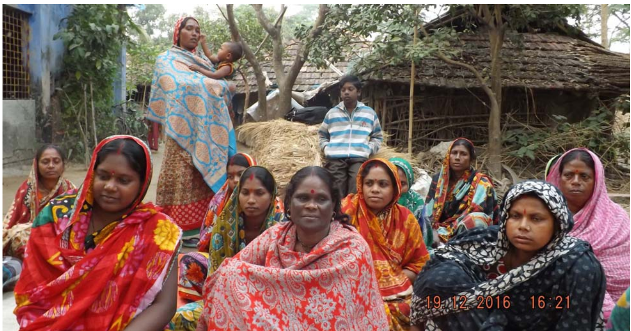
A women's group of an indigenous community organised by an NGO near Sundarbans.

In response to the situation, NGOs and government agencies have developed programmes of work and community based systems to reduce disaster impact which remains one of the most impressive achievements in community development efforts in Bangladesh. Here, women and marginal groups play an important role. But gains in this area seem to face a challenge now from the major economic development projects imposed from the top by the government. The question now is, how do we convince the government authorities that they need to be extra careful about the longer-term interest of the country by safe-guarding its environment and eco-systems? How do we effectively hold the government