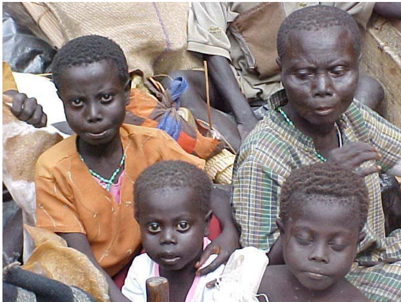
Indigenous Tribes of Andaman and Nicobar Islands.

everyday life revolving around their rites and rituals. Whether its Trobriand Islanders of South Pacific or Andamanese, Onges, Jarawas, Shompens, Sentineles and Nicobarese of Andaman and Nicobar Islands, all have braved the uncertainties of life and risk of living in the forests by revering the Gods or propitiating the witches and evils through rituals and magic. They lived peacefully and contently, till we the 'civilized' made inroads into their lives.